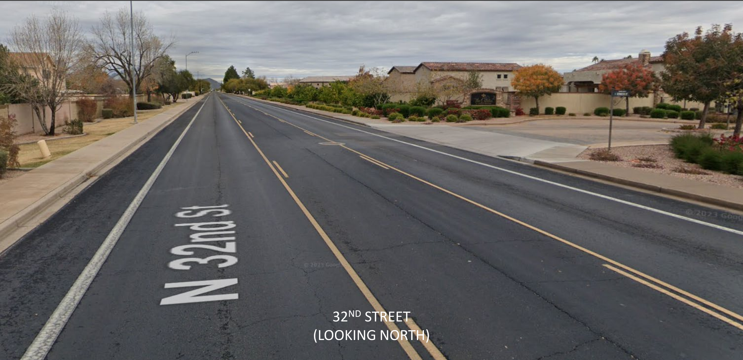
32 ND STREET (LOOKING NORTH)